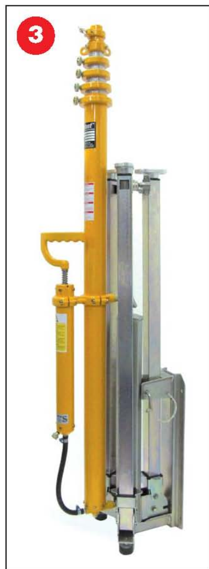
Tripod Mounting Bracket with tripod stand and mast mounted