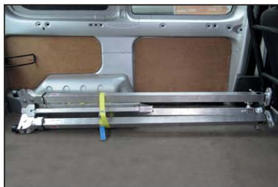
Horizontal storage position