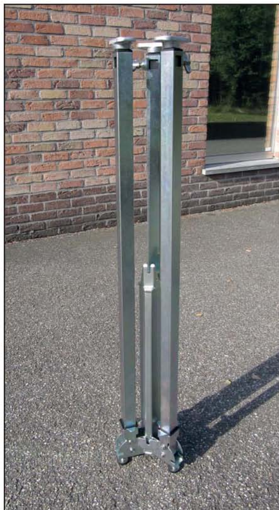
Vertical storage position

This very stable stand folds vertically and is easy to carry and store. All Mk VI Tripods can either be stored vertically or horizontally. Suitable for rotatable and non-rotatable QT masts up to 15 metres.