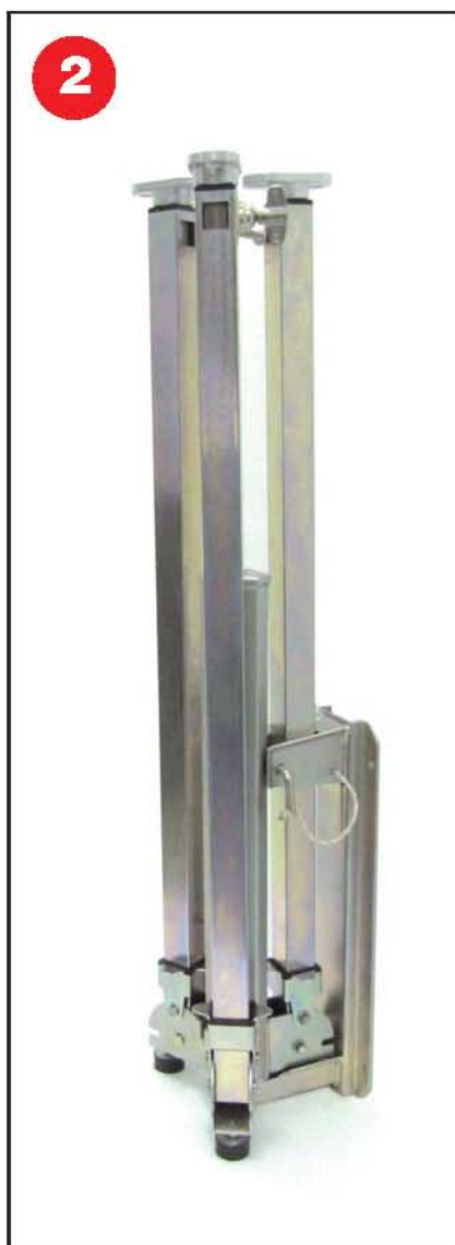
Tripod Mounting Bracket with tripod stand mounted